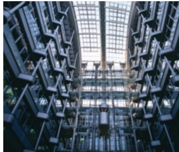
The Charité is Europe's largest university hospital and a prestigious partner of TSB Medici.