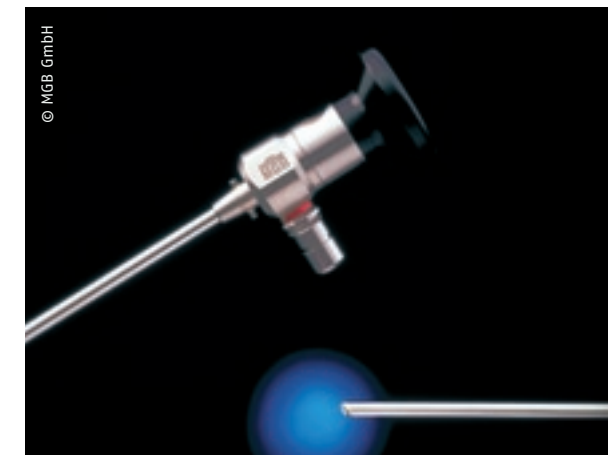
MGB – Endoscopic telescopes and complete systems for the MIC.

The Medical Technology Masterplan is one of the 12 activity areas of the Masterplan for the Health Economy in Berlin-Brandenburg, which encompasses the entire health sector in the region.