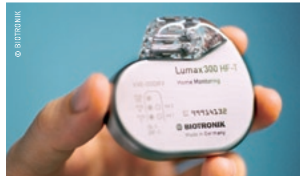
State-of-the-art telecardiology: the cardiac insufficiency therapy system Lumax HF-T.

The task of TSB Medici is to develop Berlin-Brandenburg into an even more vibrant and internationally recognised centre of medical technology.